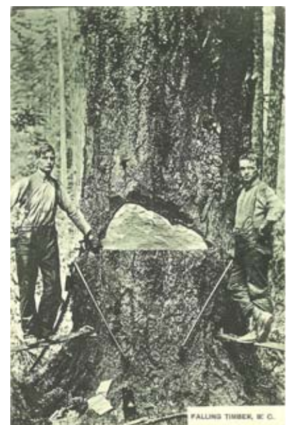
Falling Timber, B.C.