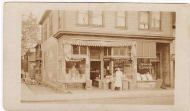
The California Grocery was located on the corner of Seymour & Nelson Sts, approx. 1922