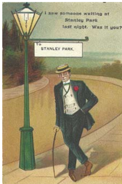
"I saw someone waiting at Stanley Park last night. Was it you?"

Page 6 - Cheramy's Chatter Page 7 - American Views - "Mall Things Considered" Page 8 - Annual Postcard Show; Schofield/B.C. Photo Card Co.: Don't Worry - Smile