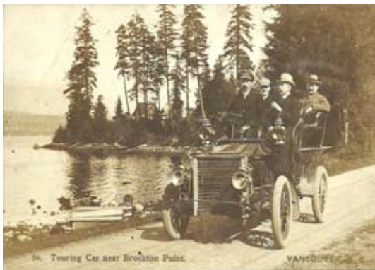
60. Touring Car near Brockton Point, Vancouver, B.C.