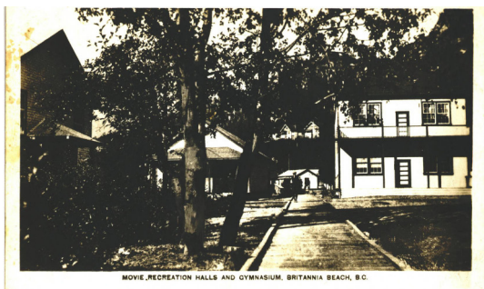
Movie Recreation Halls and Gymnasium, Britannia Beach, B.C. Postcard, Gowen Sutton Co. Ltd., Vancouver, B.C.