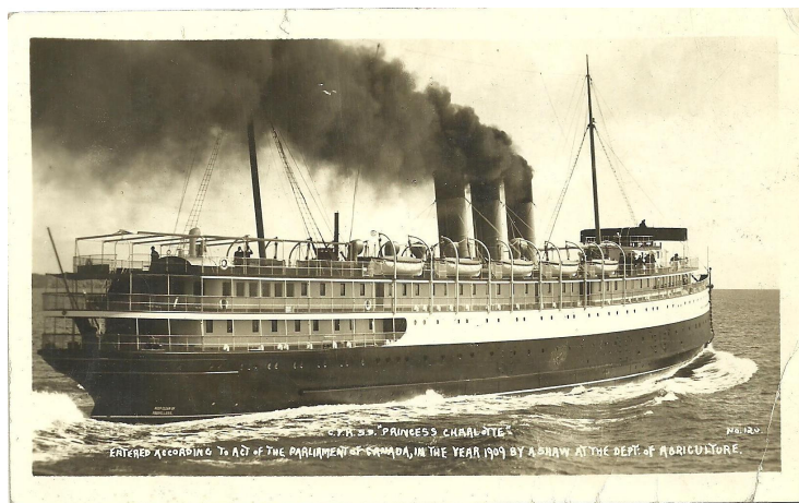
C.P.R. SS Princess Charlotte.