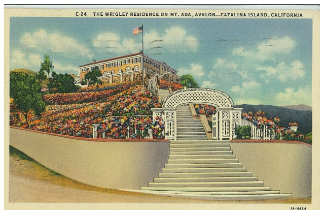
The Wrigley Residence on Mt. Ida, Avalon, Catalina Island, California.

two postcards featuring Catalina, a recollection complemented by the fact that from the 1920s through the 1940s the Chicago Cubs used the southern tip of this island as their baseball home for Spring Training. This island also featured the palatial residence of William