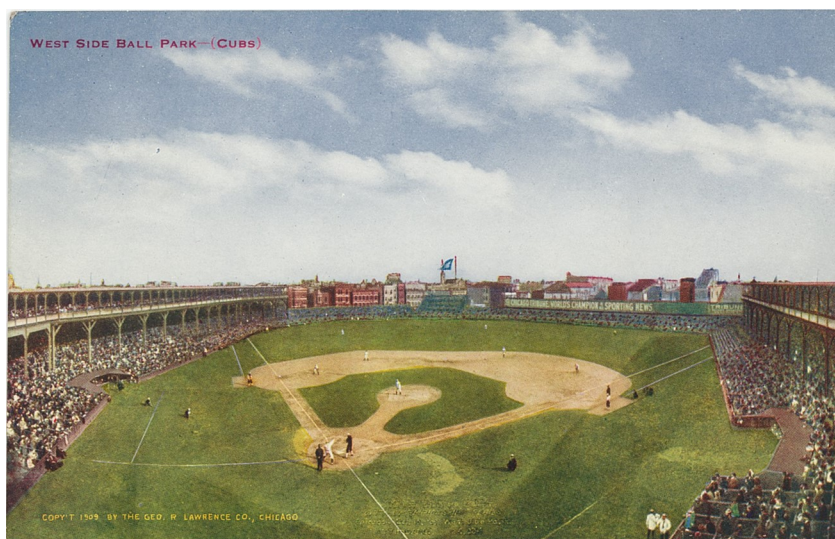
This West Side Ball Park [Cubs] postcard is copyright 1909 by Geo. R. Lawrence Co of Chicago and published by V.O. Hammond Publishing Co. of Chicago.

1908 was a memorable year at West Side with one such example occurring when the Cubs’ owner placed the visiting press in the last row of the grandstand and with the front rows filled with buyers of scalped tickets.