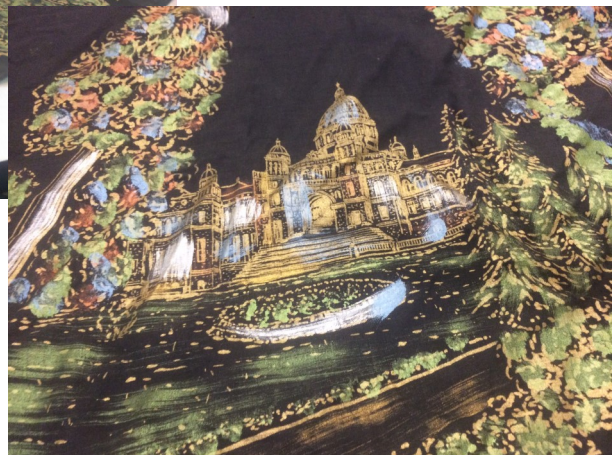
Others are available. Contact diane_rogers@shaw.ca