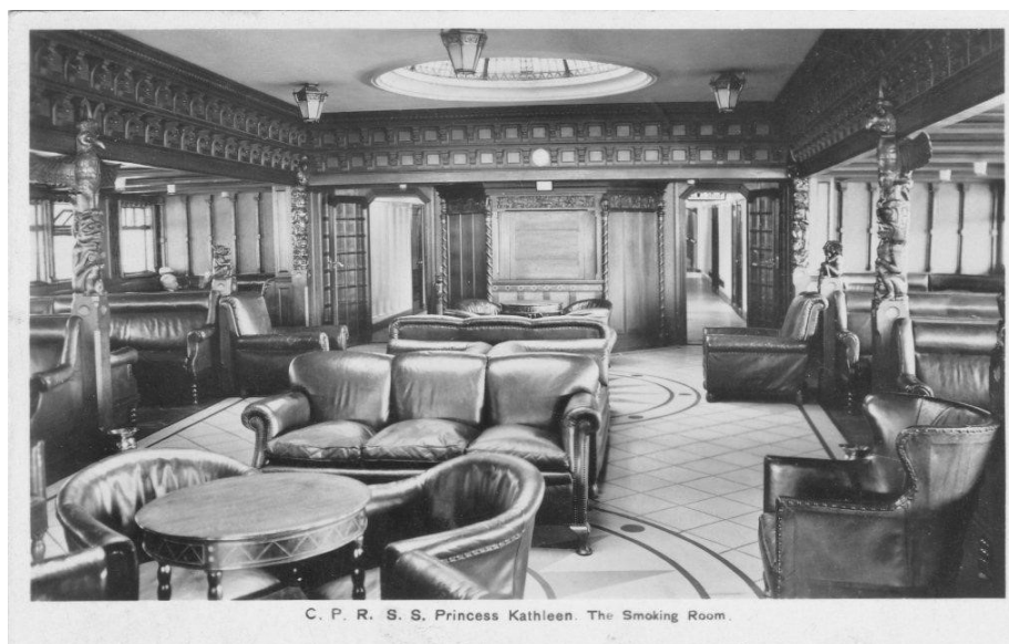
C. P. R. S. S. Princess Kathleen. The Smoking Room.