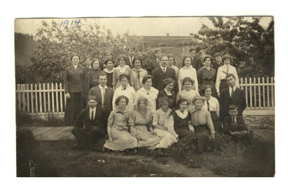
Kaslo BC High School class, postcard 1914.